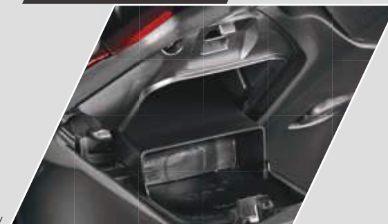
FRONT GLOVE BOX

Fuel filling right at your fingertips. Now get fuel filled while sitting on your scooter.