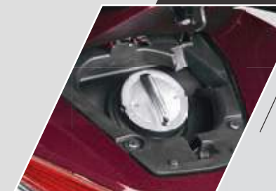
DOUBLE LID EXTERNAL FUEL FILL

One compact console ensures safety of the vehicle and convenience of opening underseat storage & external fuel lid.