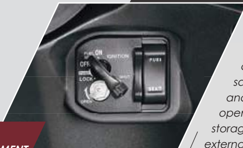
MULTI FUNCTION SWITCH UNIT

One compact console ensures safety of the vehicle and convenience of opening underseat storage & external fuel lid.