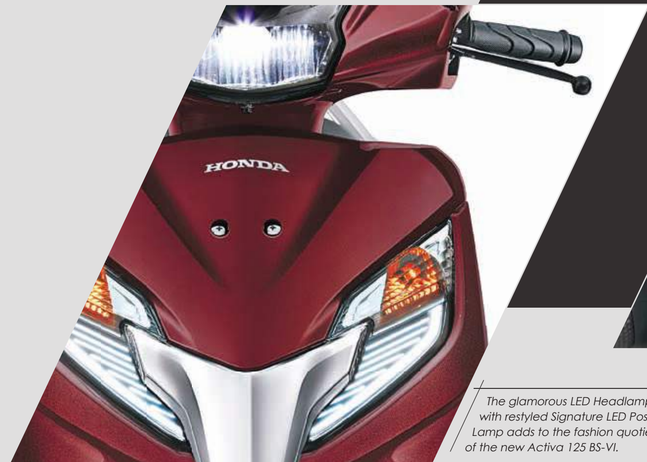
LED HEADLAMP AND SIGNATURE LED POSITION LAMP

The glamorous LED Headlamp with restyled Signature LED Position Lamp adds to the fashion quotient of the new Activa 125 BS-VI.