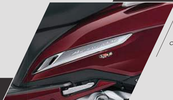
PREMIUM CHROME ON BODY

Spacious front glove box adds additional storage space.