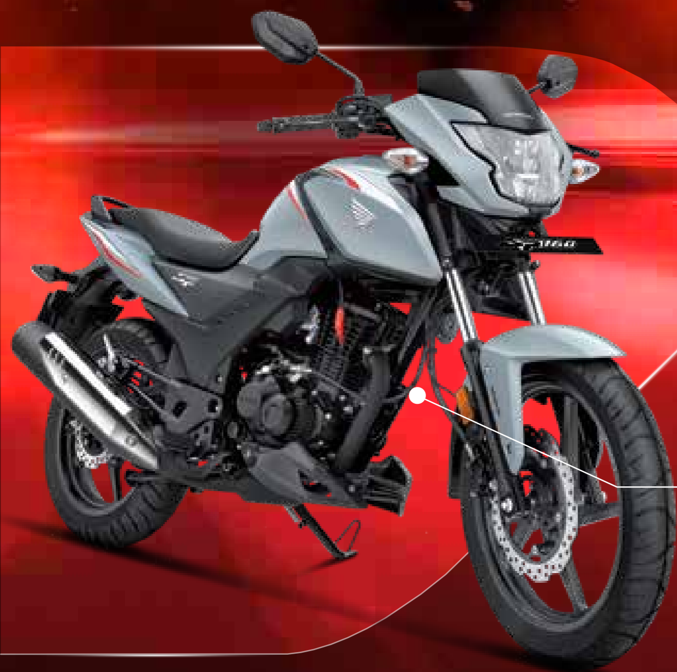
PEARL DEEP GROUND GRAY