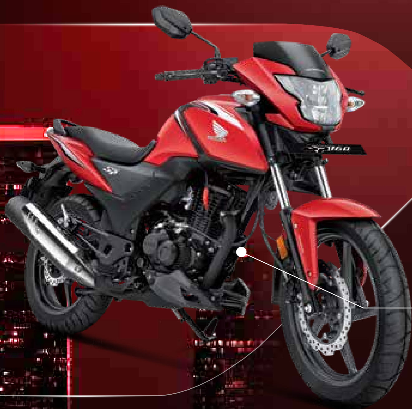
RADIANT RED METALLIC

The dynamic new color palette radiates confidence and style, making every ride a bold statement that says you've arrived.