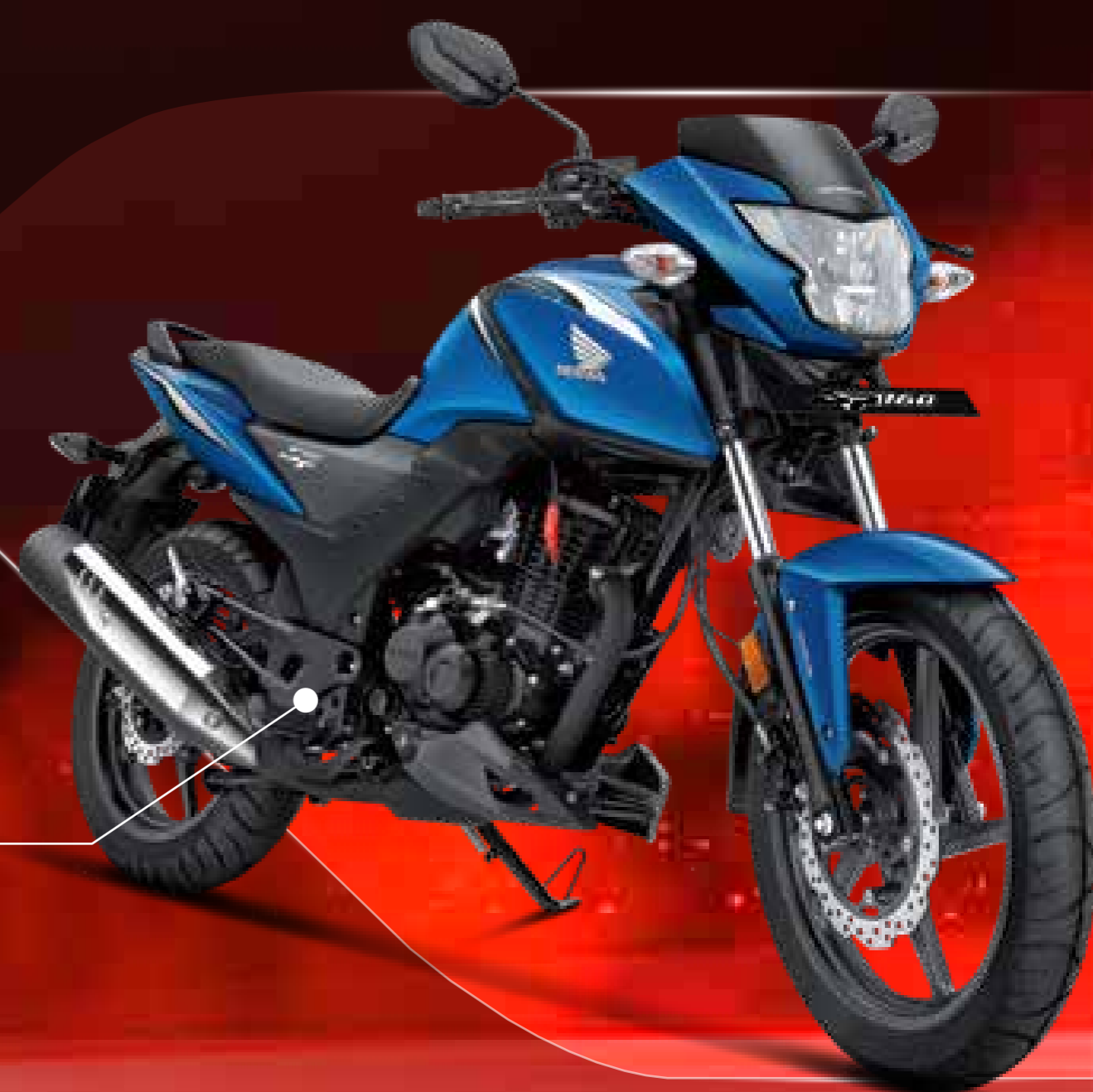
ATHLETIC BLUE METALLIC